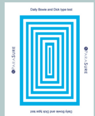
Unprocessed Test Pack Indicator Sheet

For further information about any of our products, please visit: www.parasure.co.uk