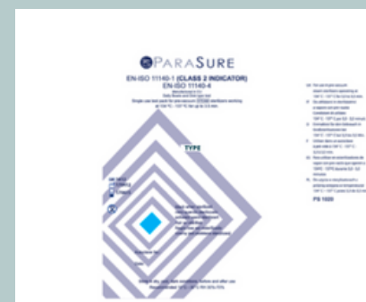
Reverse of Indicator Sheet