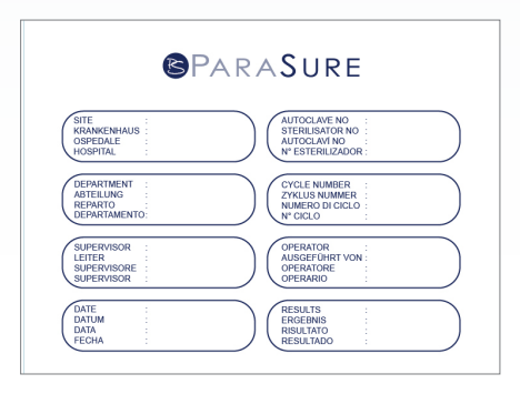
Reverse of Indicator Sheet